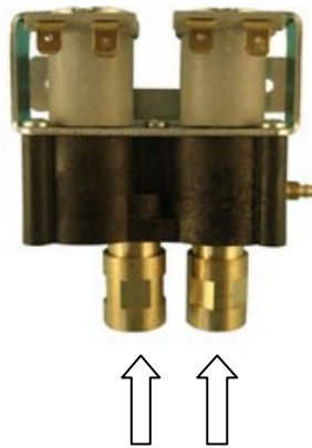
SA-M1444 – SOLENOID VALVE